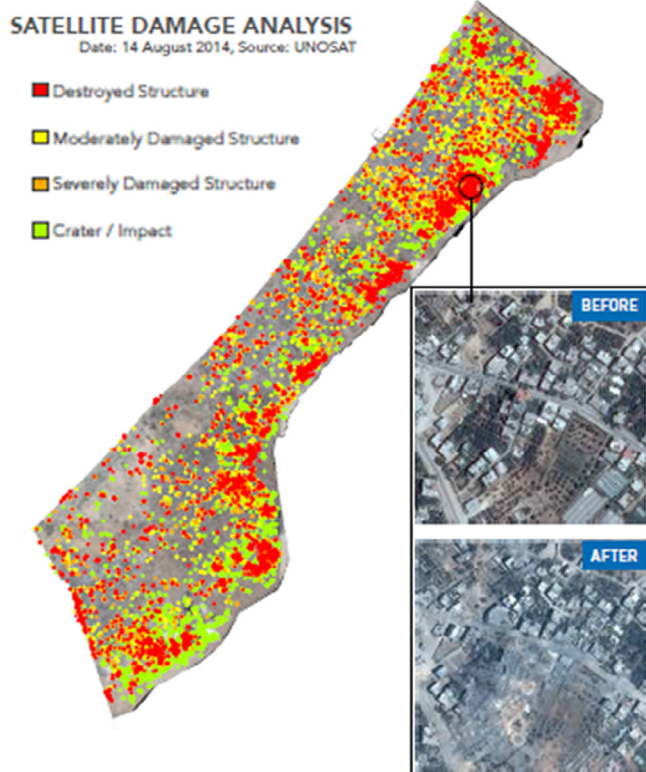
Fig. A1. Damages.